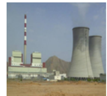
Pre-heating Steam Plants